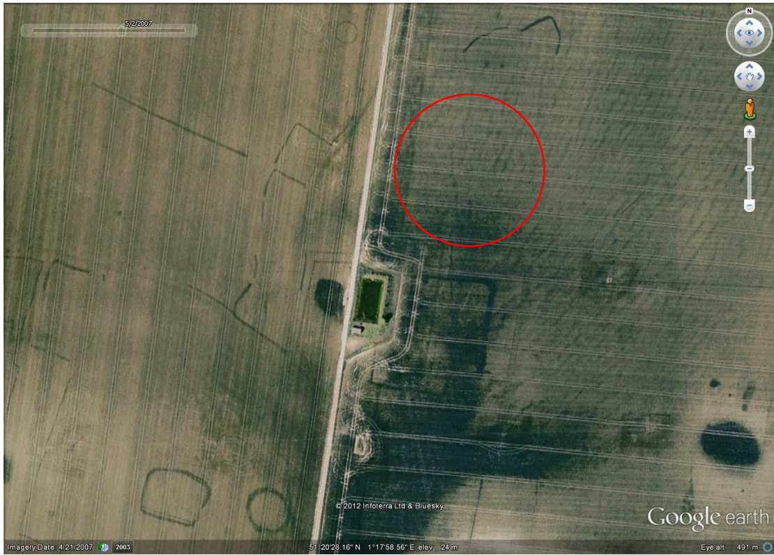
Plate 2. Google Earth showing a plethora of cropmarks surrounding the solar installation (red circle)