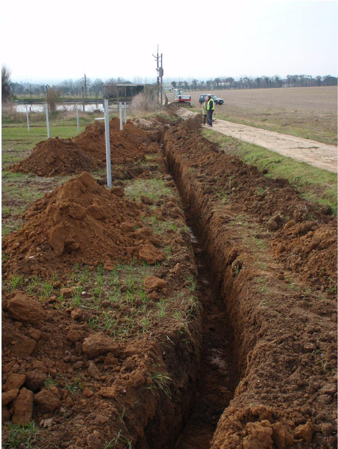
Plate 1. Showing excavation for cabling (facing south)