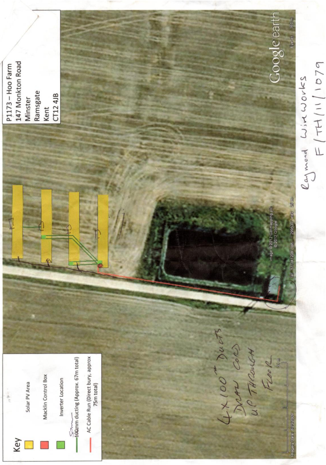
Plate 3. Showing aerial photo of site with proposed installation